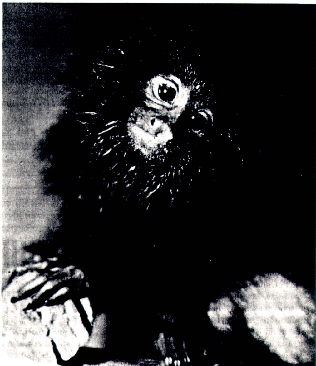
Black lion tamarin ( Leontopithecus chrysopygus ).